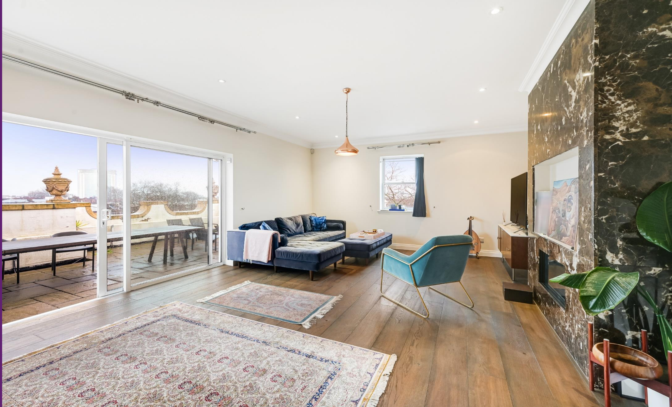
Moscow Mansions 224 Cromwell Road, SW5