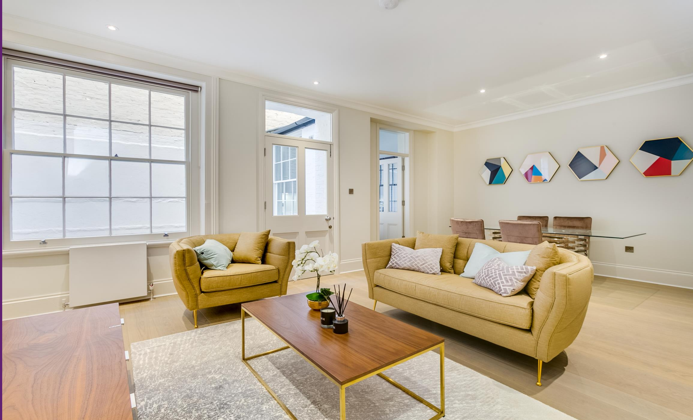
Queens Gate Terrace South Kensington, SW7