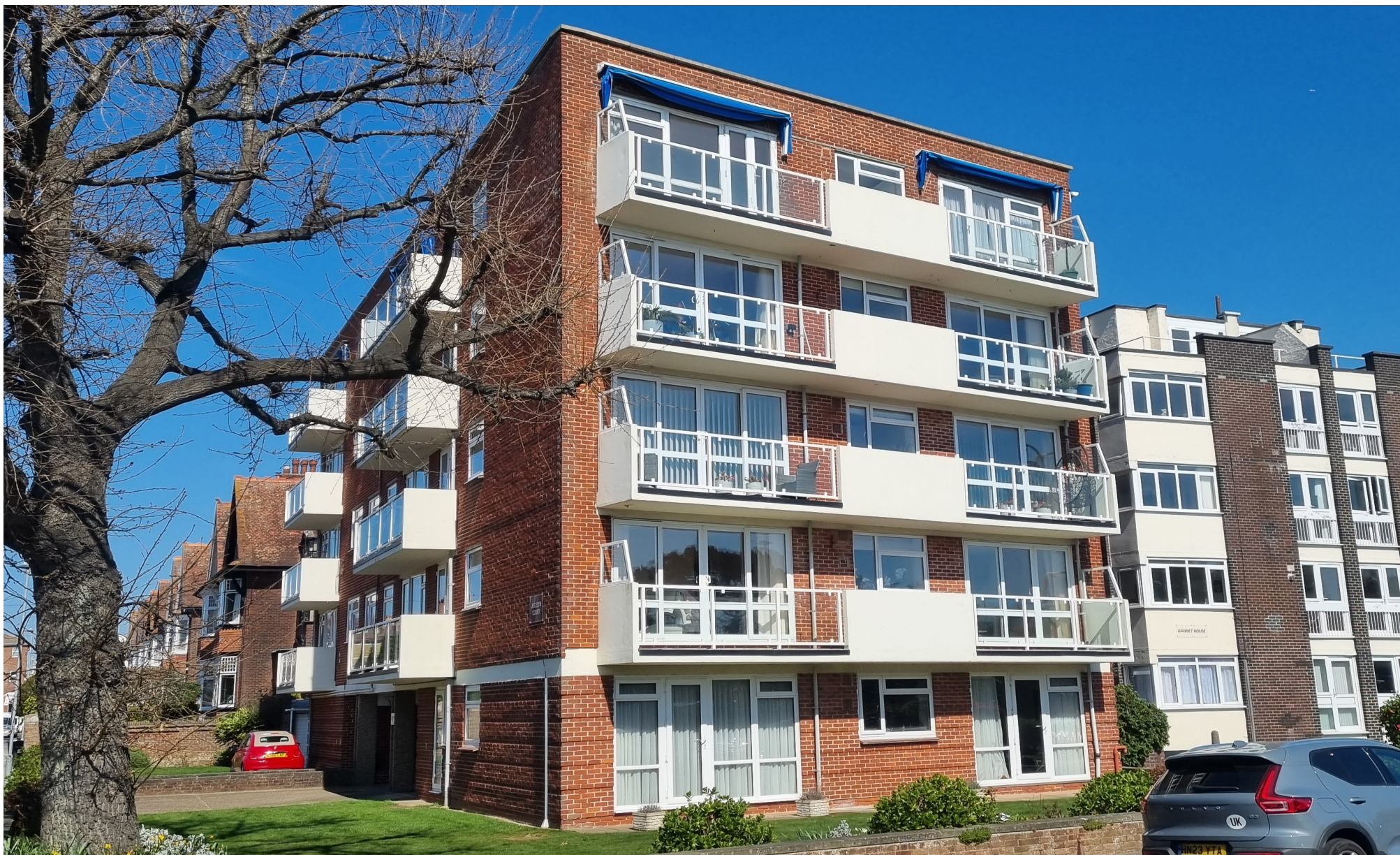
11 Jocelyn Court | Eastern Parade Southsea | Hampshire | PO4 9RA