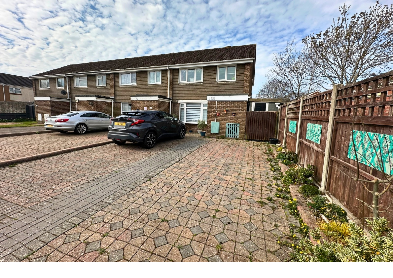
125 Marryat Road, New Milton, Hampshire. BH25 5JF