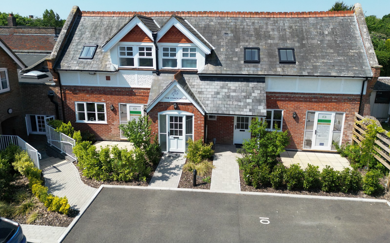
Clemming House 10 The George, Milton Green, Christchurch Road, New Milton, Hampshire. BH25 6QG Guide Price £299,950