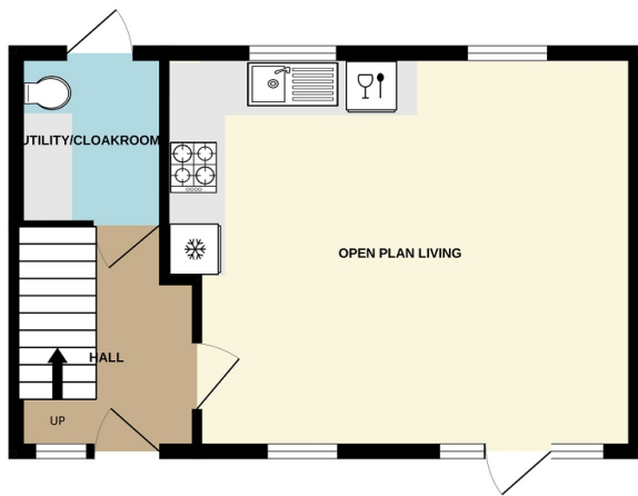
GROUND FLOOR 357 sq.ft. (33.1 sq.m.) approx.