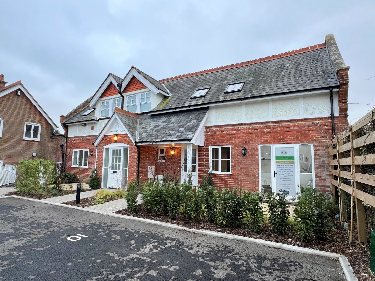
Clemming House 10 The George, Milton Green, Christchurch Road, New Milton, Hampshire. BH25 6QG Guide Price £325,000