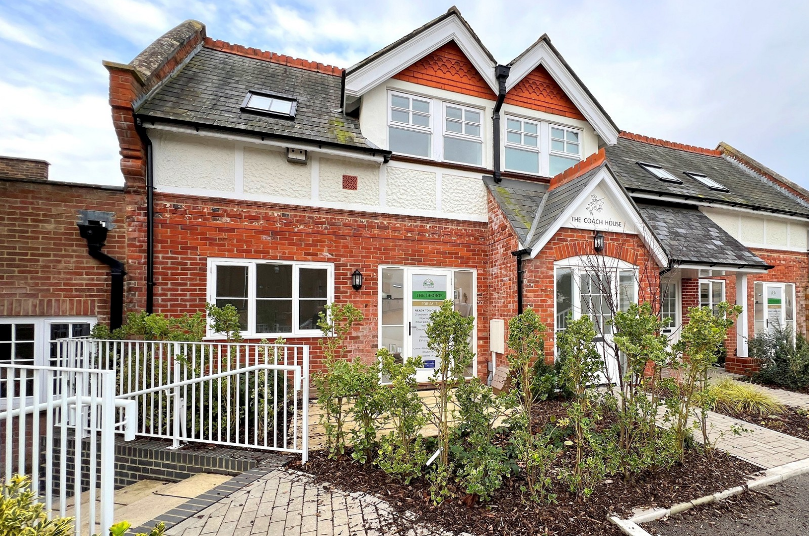
The Coach House 9 The George, Milton Green, Christchurch Road, New Milton, Hampshire. BH25 6QG Guide Price £315,000