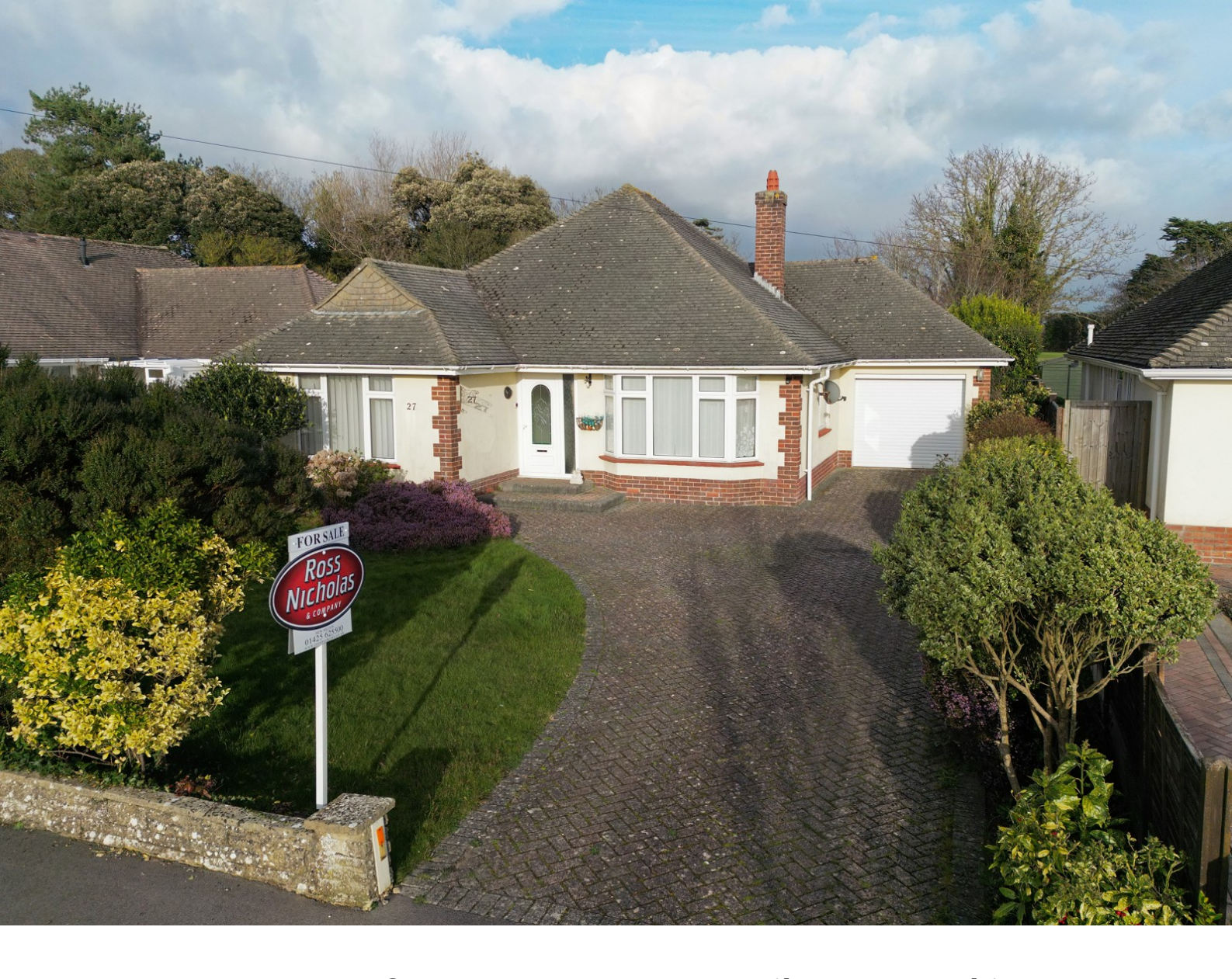
27 Barton Croft, Barton On Sea, New Milton, Hampshire. BH25 7BT £649,950