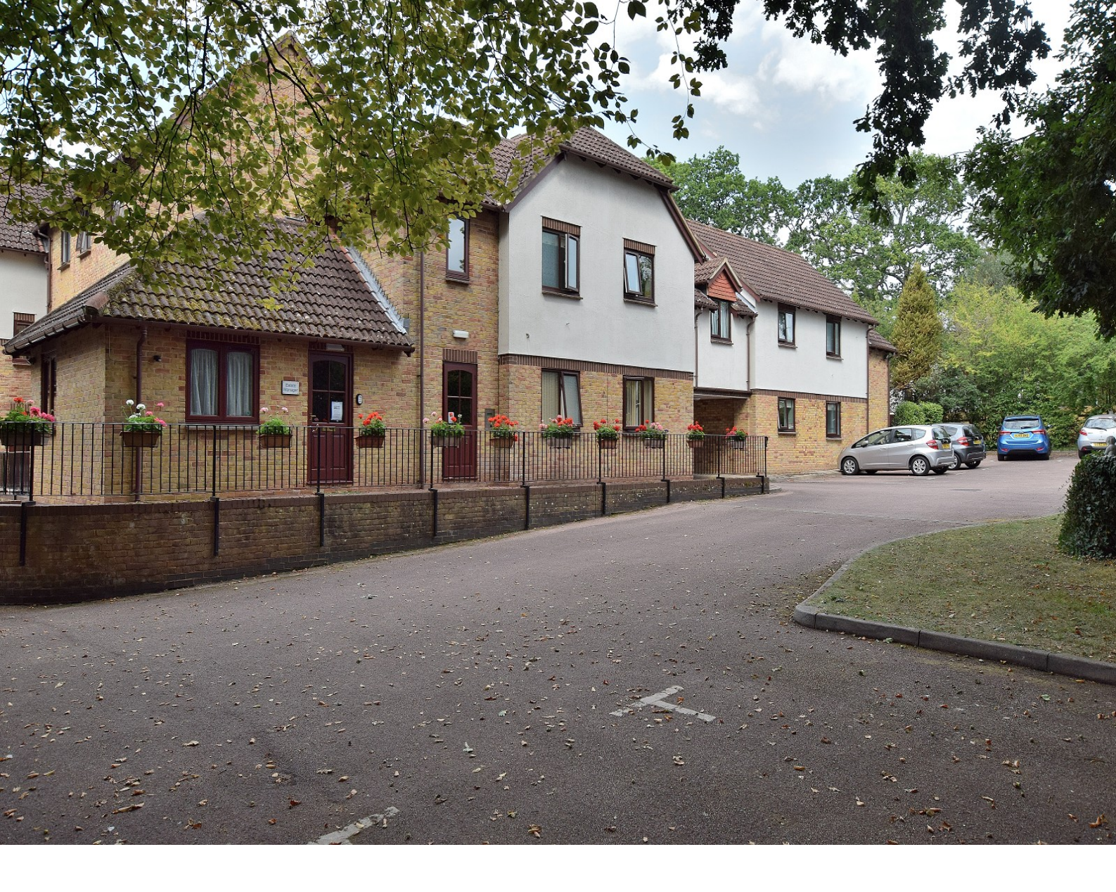
2 Lakeside Pines Barrs Avenue, New Milton, Hampshire. BH25 5GQ £139,950