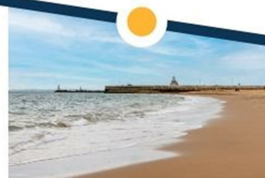
Ramsgate Main Sands beach