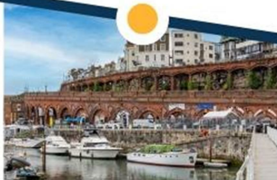
Ramsgate Royal Harbour