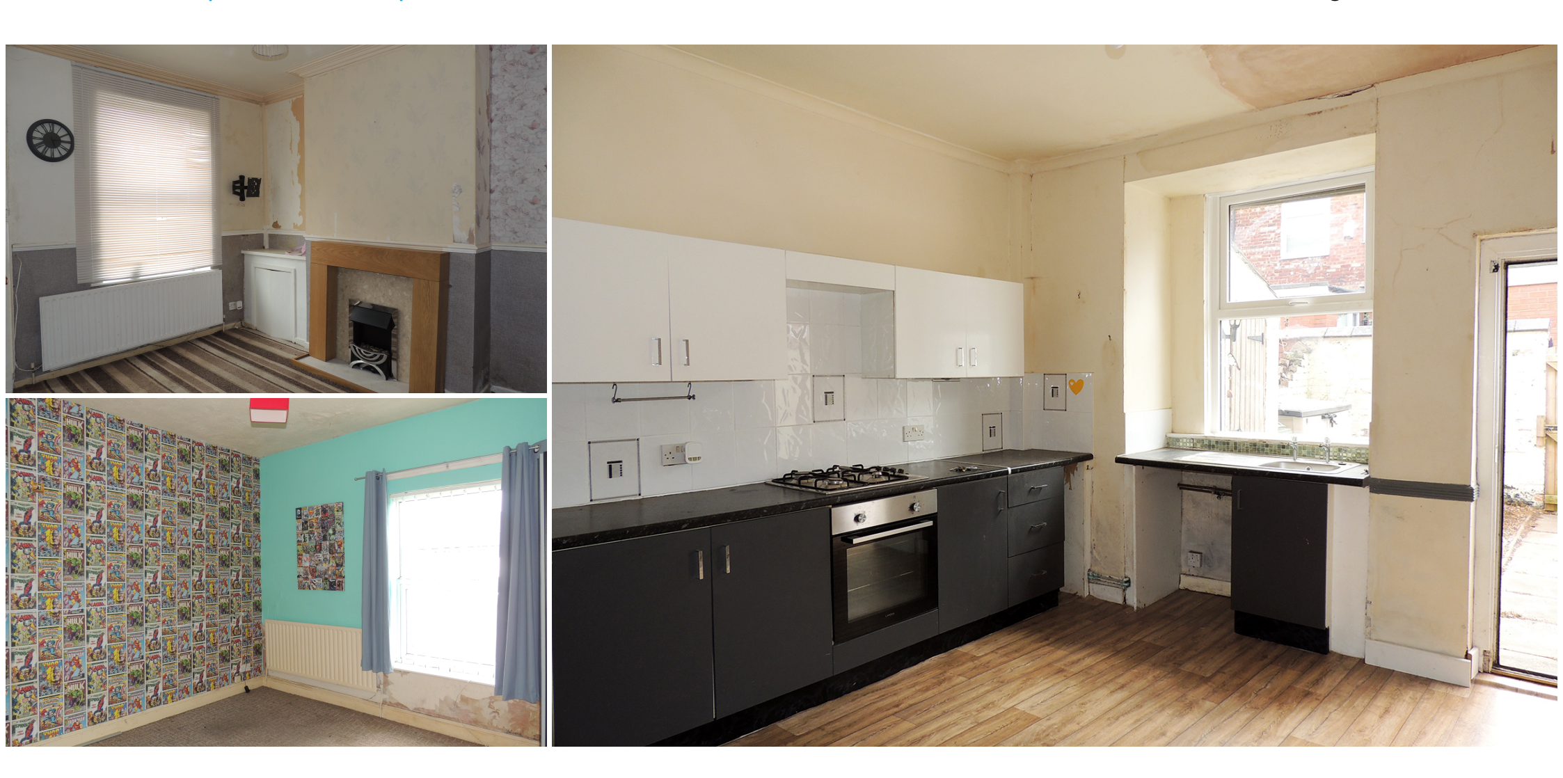
TO BE SOLD BY ONLINE AUCTION ON 14TH MAY 2025 UNLESS SOLD PRIOR UNDER AUCTION TERMS.