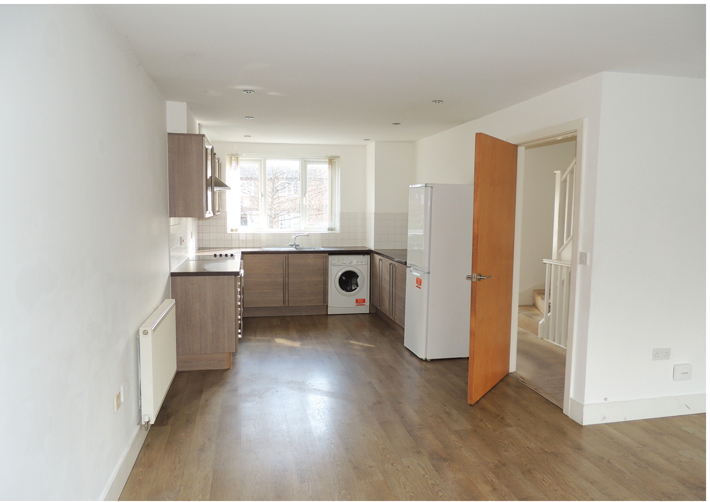
TO BE SOLD BY ONLINE AUCTION ON 23RD APRIL 2025 UNLESS SOLD PRIOR UNDER AUCTION TERMS.

Villa 41, Lakeside Rise, Blackley, M9 8QF