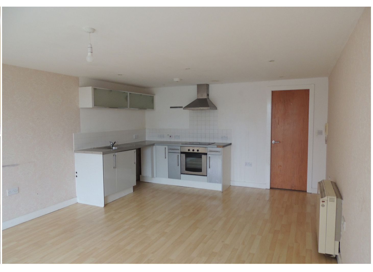
TO BE SOLD BY ONLINE AUCTION ON 26TH MARCH 2025 UNLESS SOLD PRIOR UNDER AUCTION TERMS.