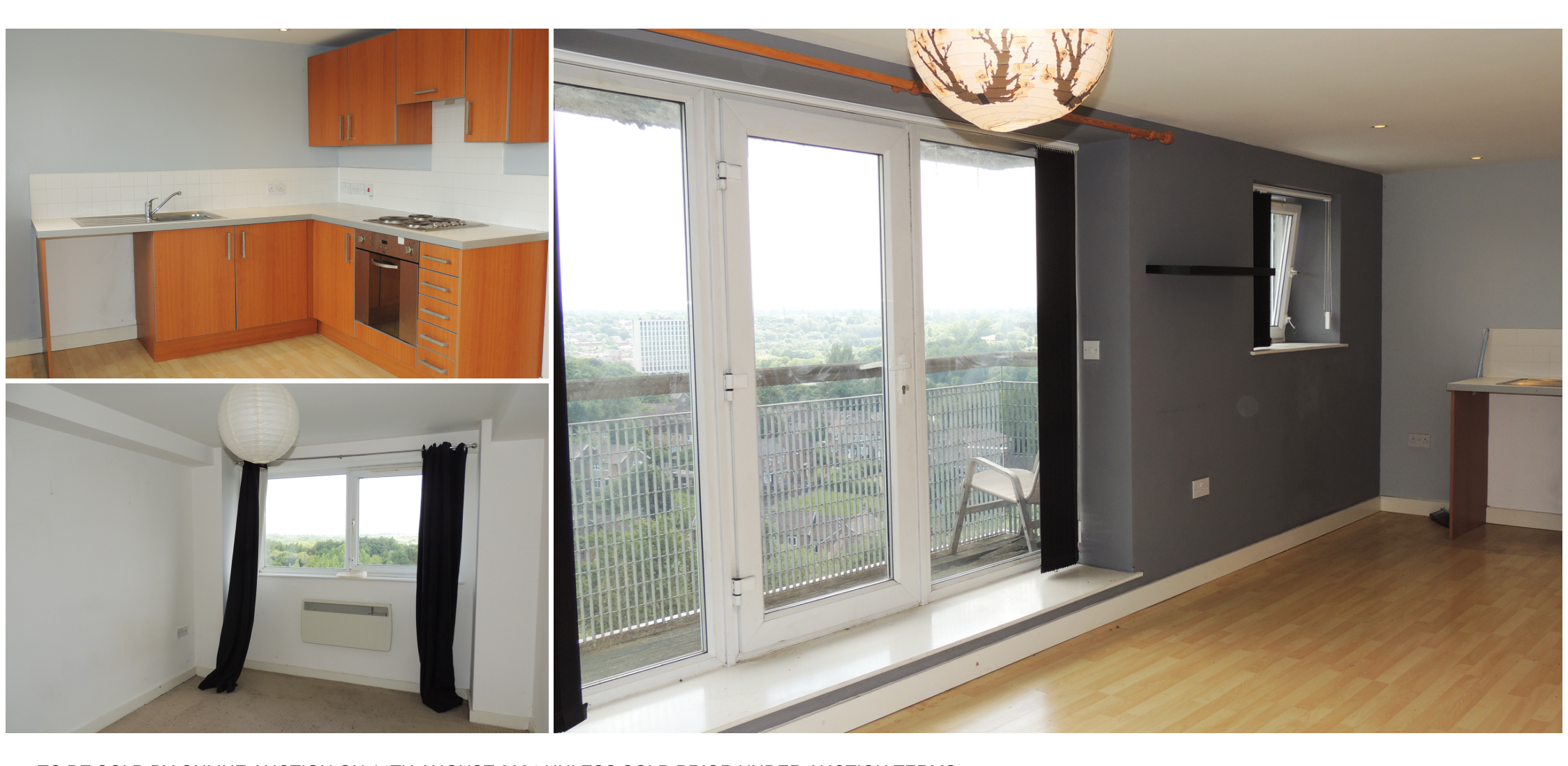
TO BE SOLD BY ONLINE AUCTION ON 14TH AUGUST 2024 UNLESS SOLD PRIOR UNDER AUCTION TERMS.