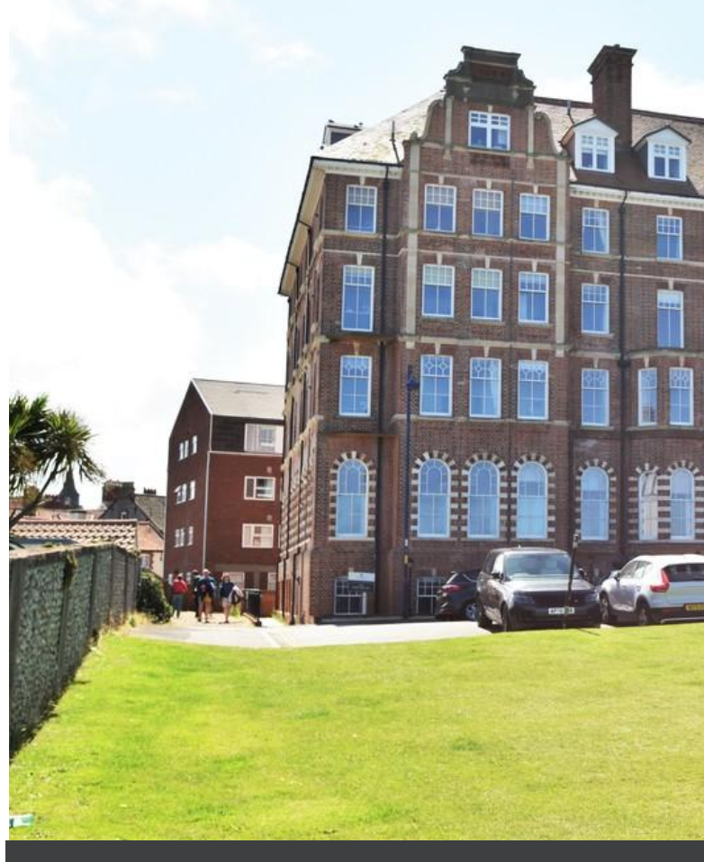
25 Burlington Place The Esplanade, Sheringham, NR26 8LG

Monday – Thursday 9am to 5.30pm Friday 9am to 5pm Saturday 9am to 4pm