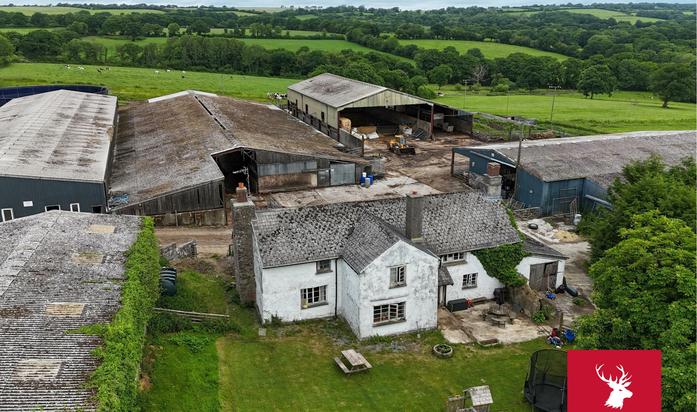
North Breazle Farm