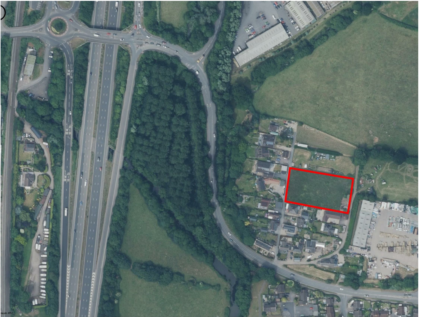
Land near Stoneyford (COMM)