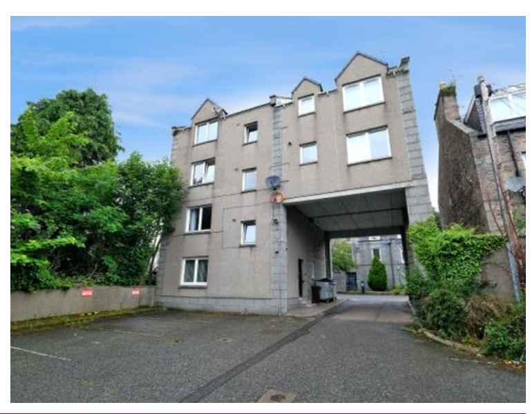
DISCLOSURE These details are intended to give a fair description only and their accuracy cannot be guaranteed nor are any floor plans (if included) exactly to scale. These details do not constitute part of any offer or contract. Intended purchasers are advised to recheck all measurements before committing to any expense and to verify the legal title of the property from their legal representative. Northwood have not tested any apparatus, equipment, fixtures or services so cannot confirm that they are in working order and the property is sold on this basis.