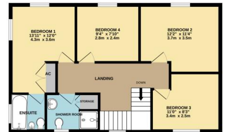
TOTAL FLOOR AREA : 1275 sq.ft. (118.4 sq.m.) approx.

Whilst every attempt has been made to ensure the accuracy of the floorplan contained here, measurements of doors, windows, rooms and any other items are approximate and no responsibility is taken for any error, omission or mis-statement. This plan is for illustrative purposes only and should be used as such by any prospective purchaser. The services, systems and appliances shown have not been tested and no guarantee as to their operability or efficiency can be given. Made with Metropix ©2023