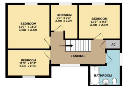
TOTAL FLOOR AREA: 1327 sq.ft. (123.3 sq.m.) approx.

Whilst every attempt has been made to ensure the accuracy of the floorplans contained here, measurements of doors, windows, rooms and any other items are approximate and no responsibility is taken for any error, omission or mis-statement. This plan is for illustrative purposes only and should be used as such by any prospective purchaser. The services, systems and appliances shown have not been tested and no guarantee as to their operability or efficiency can be given. Made with Metropix ©2024