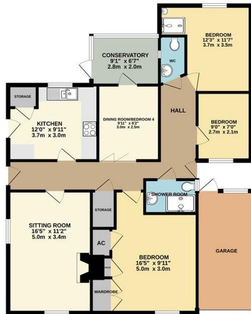
TOTAL FLOOR AREA: 1145 sq.ft. (106.4 sq.m.) approx.

Whilst every attempt has been made to ensure the accuracy of the floorplan contained here, measurements of doors, windows, rooms and any other areas are approximate and no responsibility is taken for any error, omission or mis-statement. This plan is for illustrative purposes only and should be used as such by any prospective purchaser. The services, fixtures and appliances shown have not been tested and no guarantee as to their operability or efficiency can be given. Made with Metapic C2024