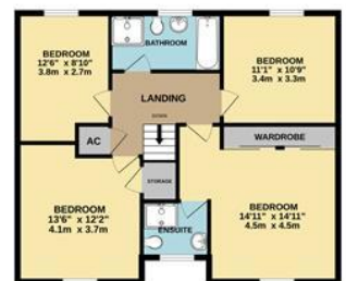
TOTAL FLOOR AREA: 1797 sq. ft. (167.0 sq. m.) approx.

Whilst every attempt has been made to ensure the accuracy of the floorplan contained herein, measurements of doors, windows, rooms and any other items are approximate and no responsibility is taken for any error, omission or mis-statement. This plan is for illustrative purposes only and should be used as such by any prospective purchaser. The services, systems and appliances shown have not been tested and no guarantee as to their operability or efficiency can be given. Made with Metropix ©2024