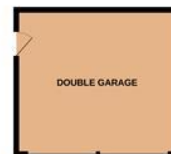
GROUND FLOOR 1025 sq. ft. (95.2 sq. m.) approx.

The EPC rating for this property is C (79).