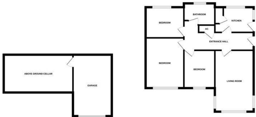
TOTAL FLOOR AREA - 1001 sq.ft. (93.0 sq.m.) approx.

Whilst every attempt has been made to ensure the accuracy of the floorplan contained here, measurements of doors, windows, rooms and any other items are approximate and no responsibility is taken for any error, omission or mis-statement. This plan is for illustrative purposes only and should be used as such by any prospective purchaser. The services, systems and appliances shown have not been tested and no guarantee as to their quality or efficiency can be given. Made with Metropix ©2024