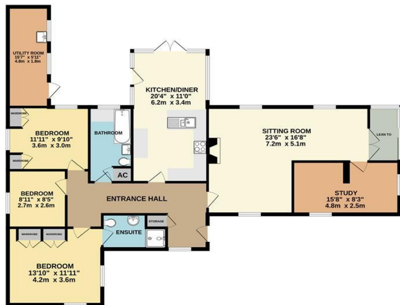
GROUND FLOOR 1407 sq.ft. (130.7 sq.m.) approx.

TOTAL FLOOR AREA: 1407 sq.ft. (130.7 sq.m.) approx. Whilst every attempt has been made to ensure the accuracy of the floorplan contained herein, measurements of doors, windows, rooms and any other items are approximate and no responsibility is taken for any error, omission or mis-statement. This plan is for illustrative purposes only and should be used as such by any prospective purchaser. The services, systems and appliances shown have not been tested and no guarantee as to their condition or efficiency can be given. Made with Metropix ©2025