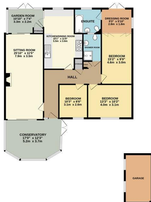
GROUND FLOOR 1550 sq.ft. (144.0 sq.m.) approx.

TOTAL FLOOR AREA: 1550 sq.ft. (144.0 sq.m.) approx. Whilst every attempt has been made to ensure the accuracy of the floorplan contained herein, measurements of doors, windows, rooms and any other items are approximate and no responsibility is taken for any error, omission or misstatement. This plan is for illustrative purposes only and should be used as such by any prospective purchaser. The services, systems and appliances shown have not been tested and no guarantee is given as to their quality or efficiency can be given. Map data © OpenStreetMap contributors