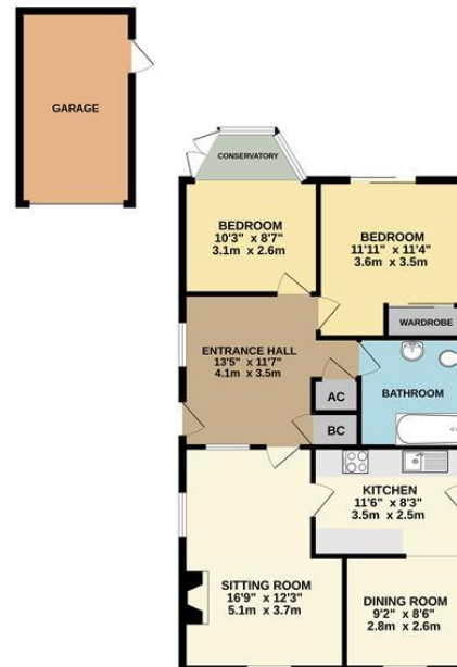
TOTAL FLOOR AREA - 930 sq. ft. (86.4 sq.m.) approx. Whilst every attempt has been made to ensure the accuracy of the floorplans contained here, measurements of doors, windows, rooms and any other items are approximate and no responsibility is taken for any errors, omissions or misstatements. This plan is for illustrative purposes only and should be used as such by any prospective purchaser. The services, systems and appliances shown have not been tested and no guarantee as to their operability or efficiency can be given. Made with Blueprints (2024)