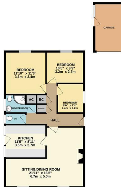
GROUND FLOOR 908 sq.ft. (84.4 sq.m.) approx.

TOTAL FLOOR AREA: 908 sq.ft. (84.4 sq.m.) approx. Whilst every attempt has been made to ensure the accuracy of the floorplan contained here, measurements of doors, windows, stairs and any other items are approximate and no responsibility is taken for any error, omission or mis-statement. This plan is for illustrative purposes only and should be used as such by any prospective purchaser. The services, systems and appliances shown have not been tested and no guarantee as to their operability or efficiency can be given. Made with Houzz ©2024