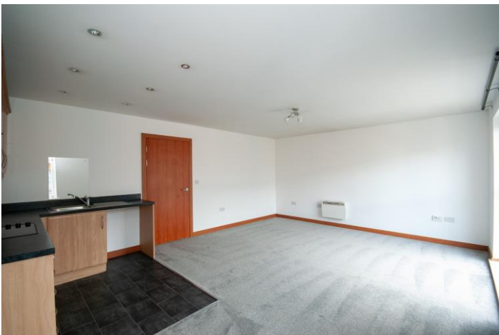
2 BEDROOMS / SECOND FLOOR FLAT / CENTRAL LOCATION