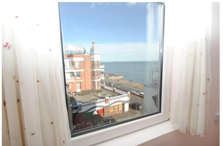
1 BEDROOM / MANAGED RETIREMENT APARTMENT / NO ONWARD CHAIN