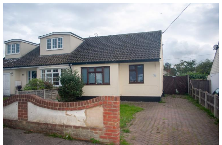
2 BEDROOMS / SEMI DETACHED BUNGALOW / OFF STREET PARKING & GARAGE