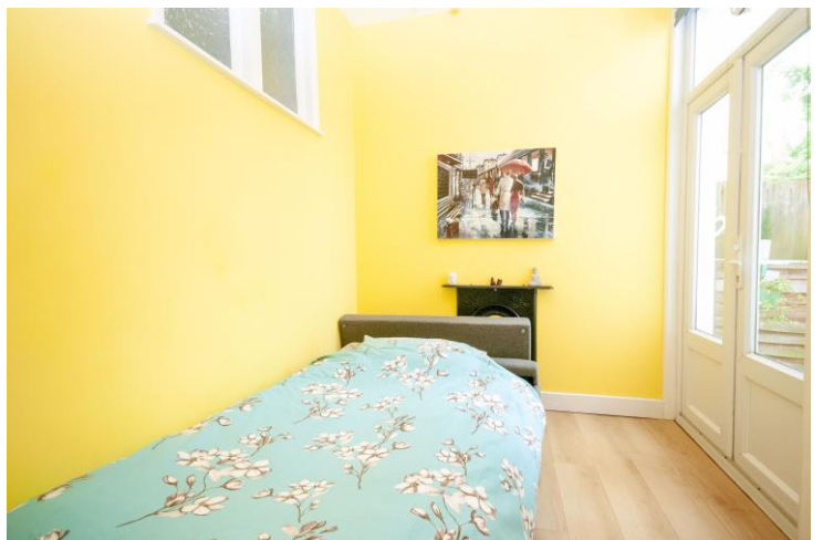
2 BEDROOMS / GROUND FLOOR MAISONETTE / OWN GARDEN / NO ONWARD CHAIN / GREAT LOCATION