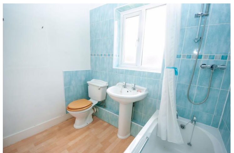
3 BEDROOMS / END TERRACED HOUSE / WEST FACING REAR GARDEN / NO ONWARD CHAIN