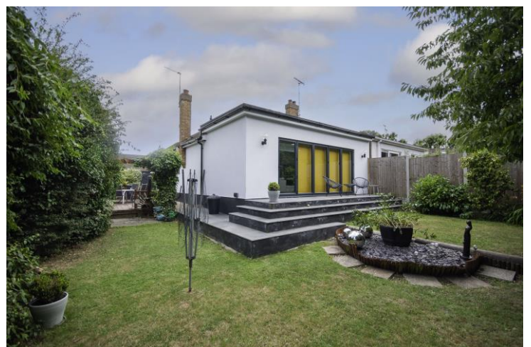
2 DOUBLE BEDROOMS / SEMI DETACHED BUNGALOW / OFF STREET PARKING