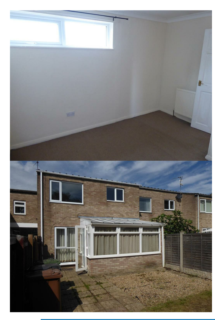
7 Holdfield Peterborough PE3 7LW