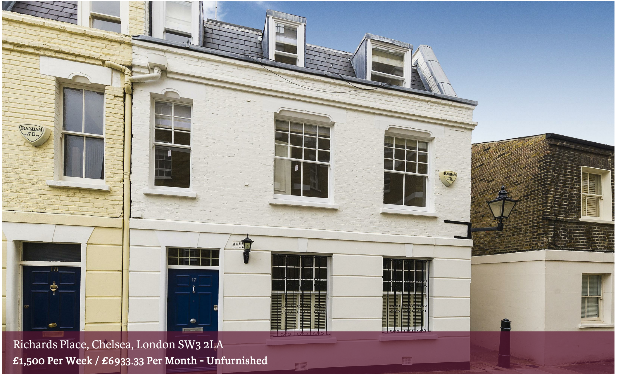
Richards Place, Chelsea, London SW3 2LA £1,500 Per Week / £6933.33 Per Month - Unfurnished