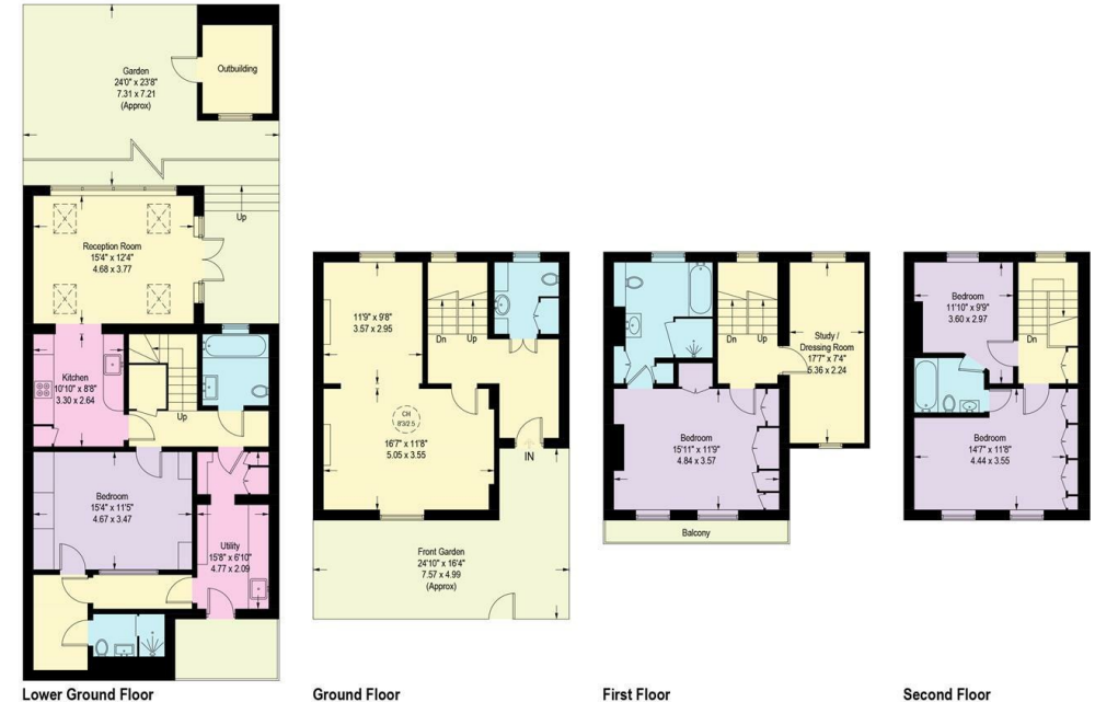
Illustration for identification purposes only, measurements are approximate, not to scale. (ID1007799)