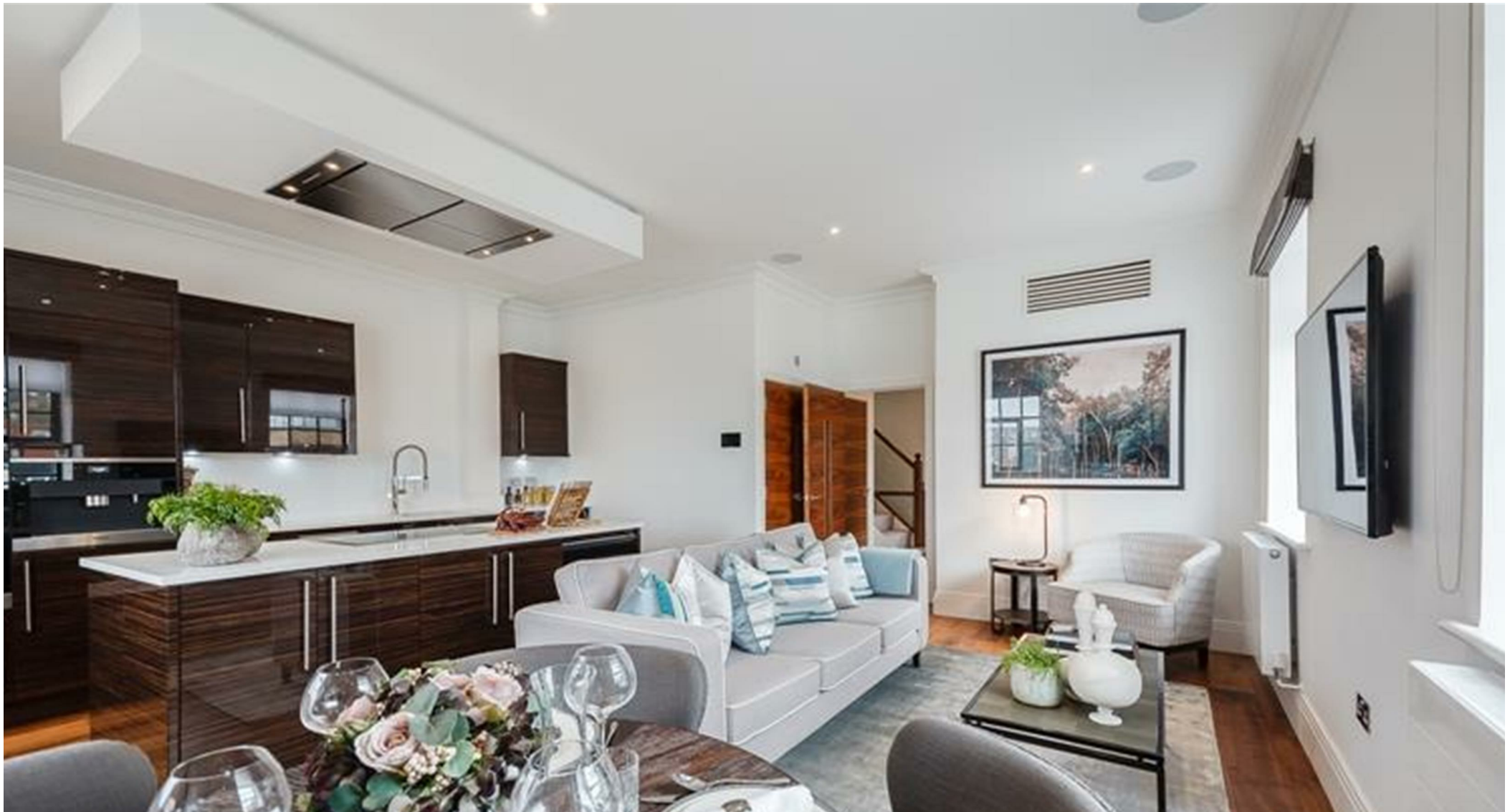
Palace Wharf, Rainville Road, London W6 9UF £1,880 Per Week