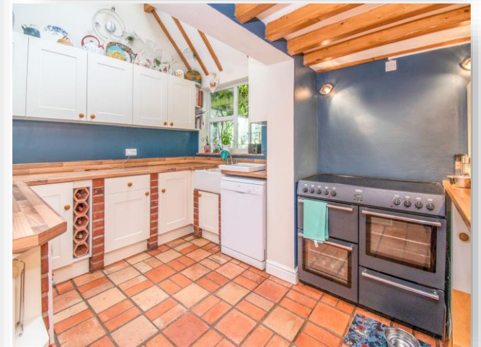
Hillside Church Street, Elsing, Dereham NR20 3EA