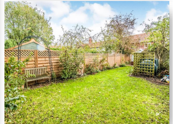
Church Lane, Cawston, NR10 4AJ