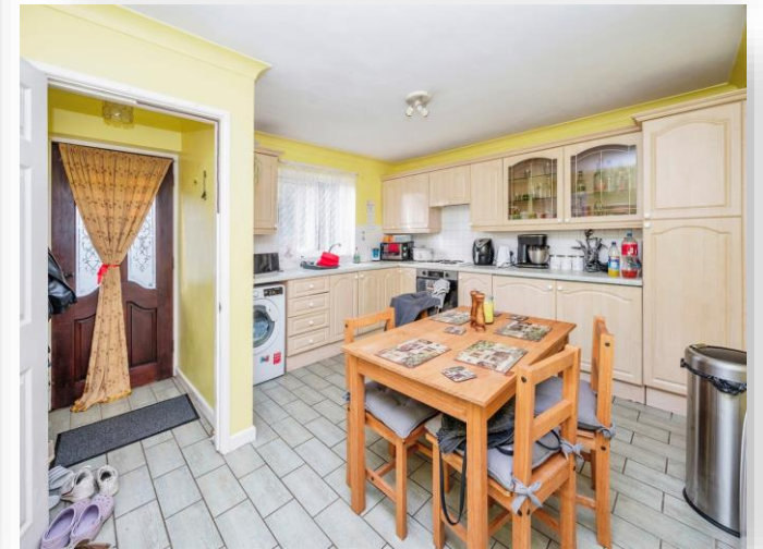
Ollands Road, Reepham, Norwich, NR10 4EJ