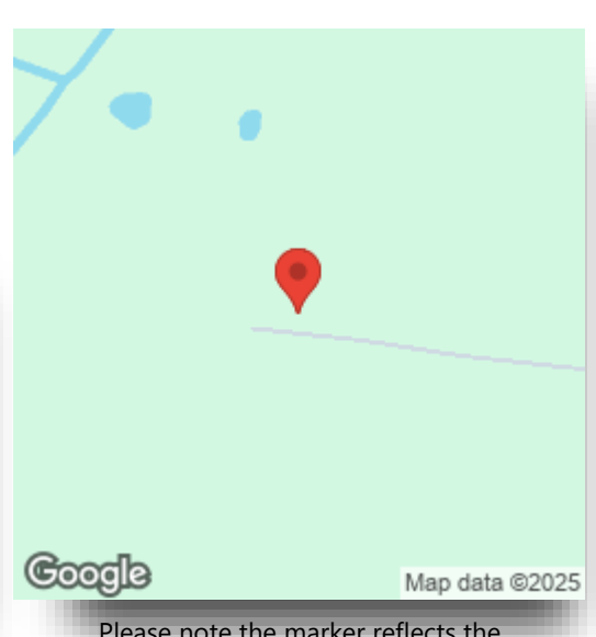
Please note the marker reflects the postcode not the actual property