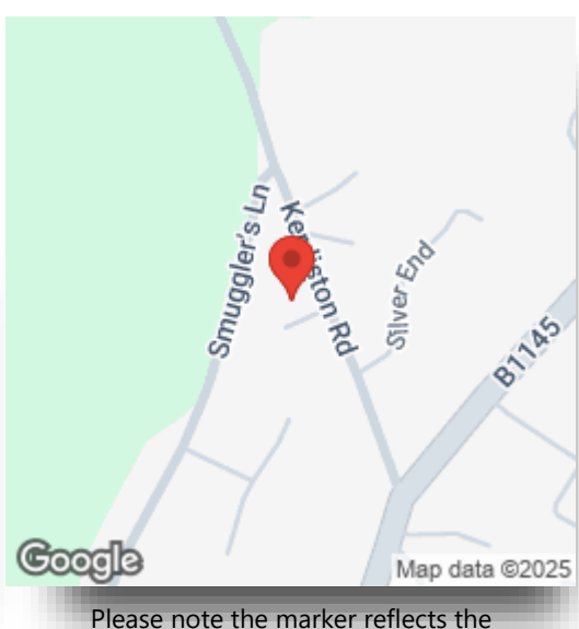
postcode not the actual property