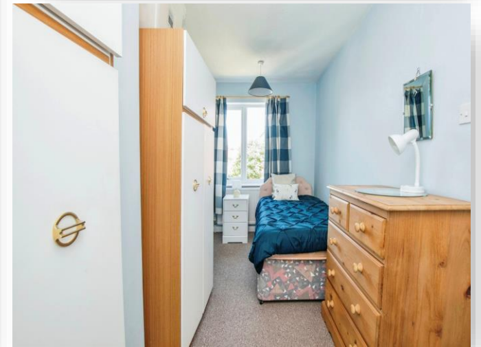
Moorhouse Close, Reepham Norwich NR10 4EG