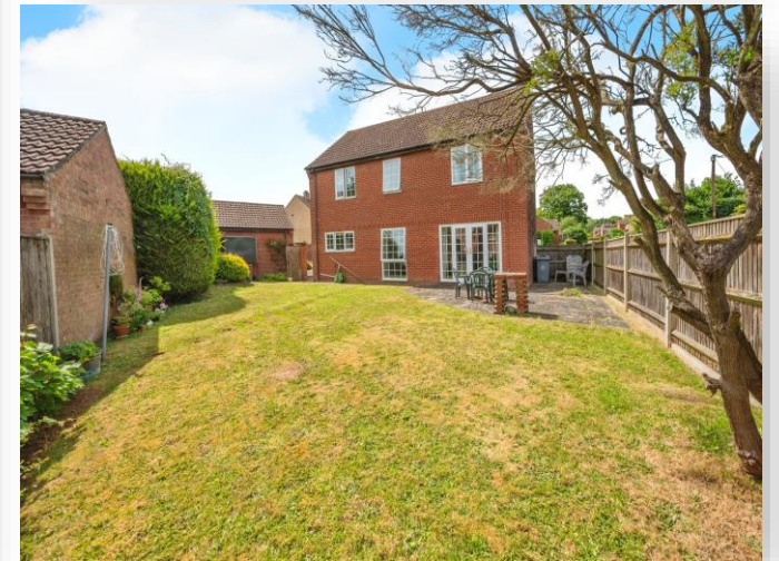
Moorhouse Close, Reepham Norwich NR10 4EG