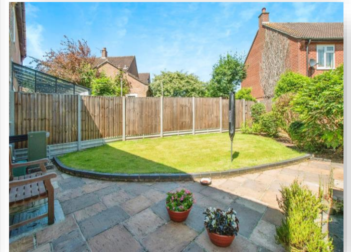
Moorhouse Close, Reepham Norwich NR10 4EG