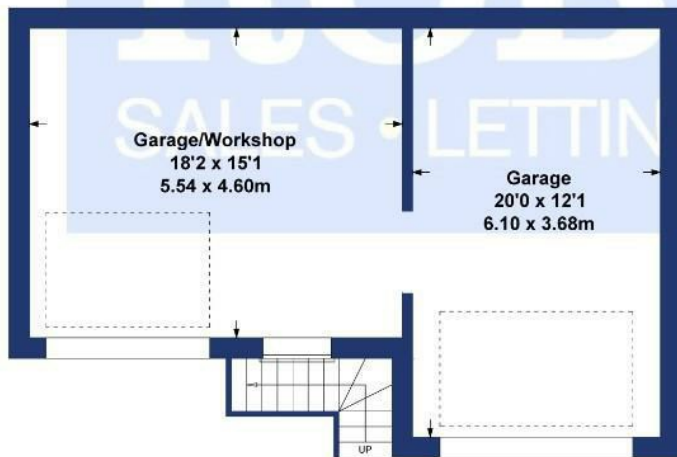
GROUND FLOOR (OUTBUILDING)