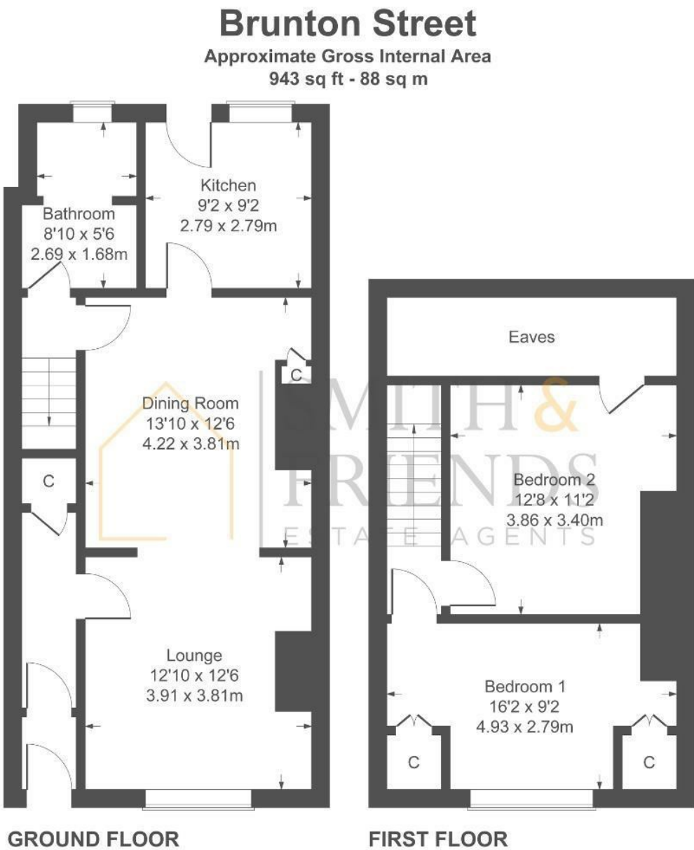
Not to Scale. Produced by The Plan Portal 2025 For Illustrative Purposes Only.

For clarification we wish to inform prospective purchasers that we have prepared these sales particulars as a general guide. We have not carried out a detailed survey, nor tested the services, appliances and specific fittings. Room sizes should not be relied upon for carpets and furnishings, if there are important matters which are likely to affect your decision to buy, please contact us before viewing the property. Smith & Friends Estate Agents can recommend financial services, surveying and conveyancing services to sellers and buyers. Smith & Friends Estate Agents staff may benefit from referral incentives relating to these services.