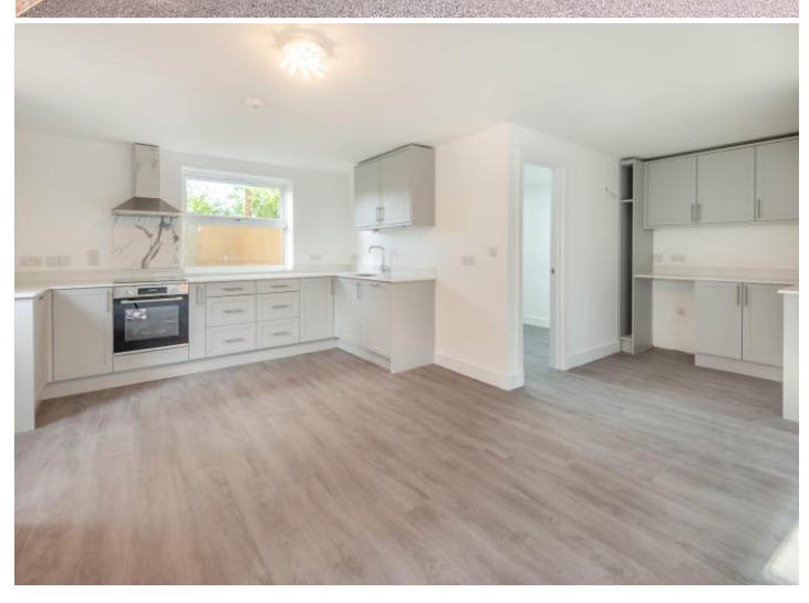
COUNCIL TAX BAND - C