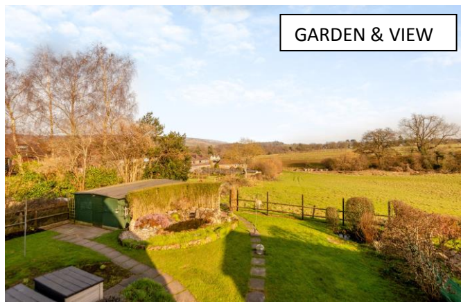
GARDEN & VIEW