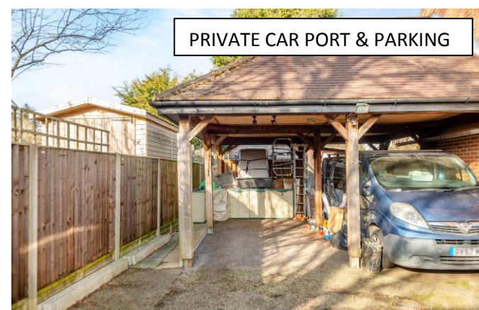
PRIVATE CAR PORT & PARKING