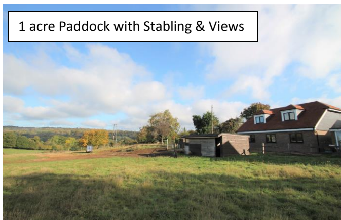
1 acre Paddock with Stabling & Views