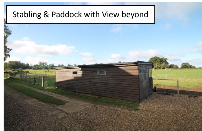
Stabling & Paddock with View beyond